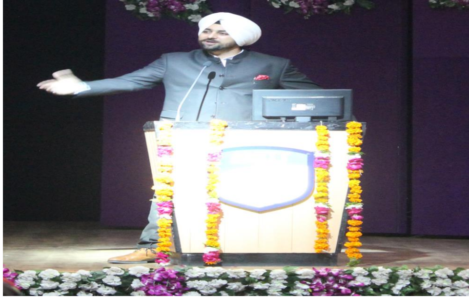
Speech by chief guest in opening ceremony