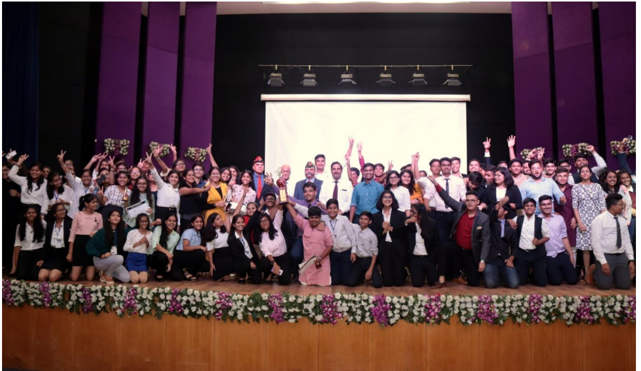
Award function in valedictory