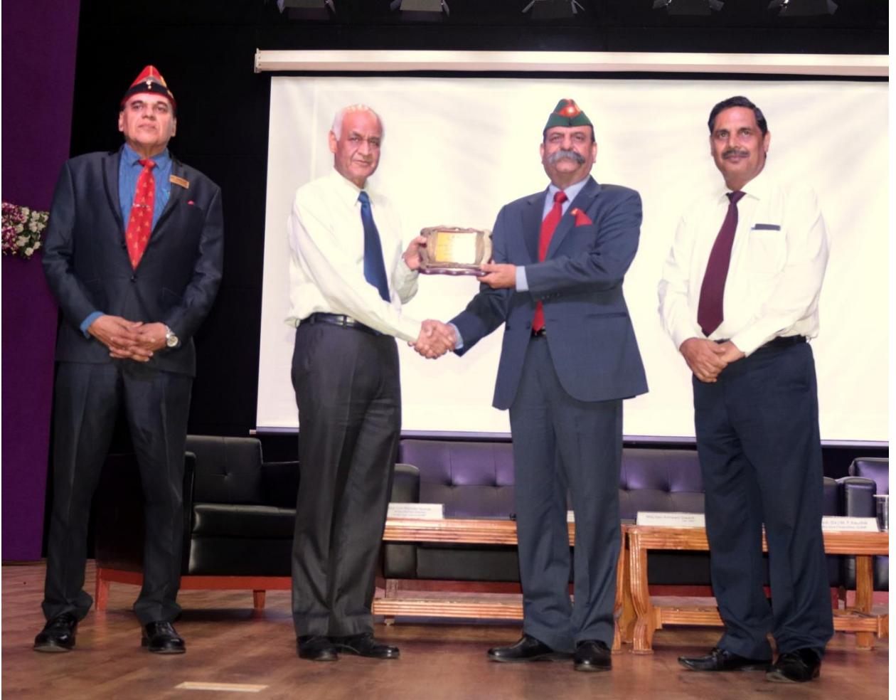
Memento to Chief Guest of Valedictory Session