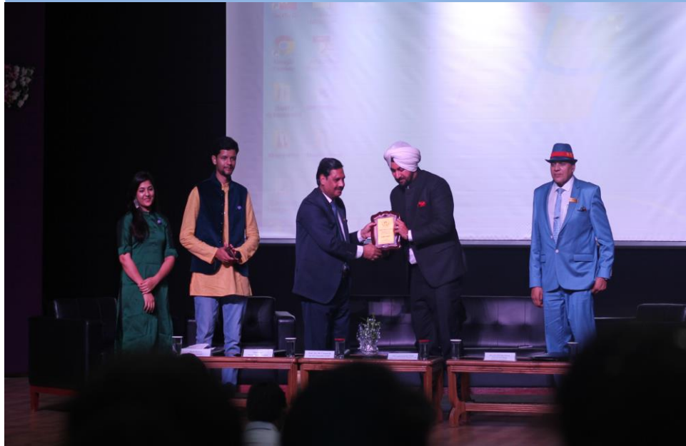
Memento to chiefguest in opening ceremony