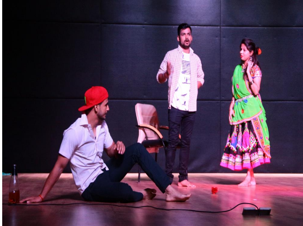
Cultural eve on 6 th August 2019